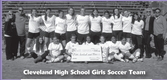
Cleveland High School Girls Soccer Team